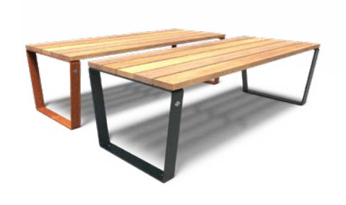
MIO 2300 TABLE