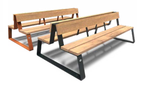
MIO 2300 DOUBLE + BACKREST